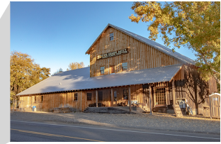
Butte Creek Mill