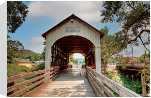
Historic Covered Bridge