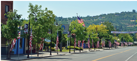
Downtown Eagle Point

Resort at Eagle Point Lodging Phone # (541) 879-3700